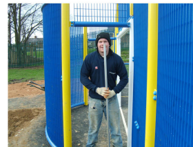
» Wheelchair accessible openings