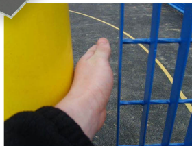
» No Feet or Hand entrapments